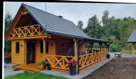
Estrela 90m 2

Quotation valid for 30 days; thereafter please contact us for updated pricing.